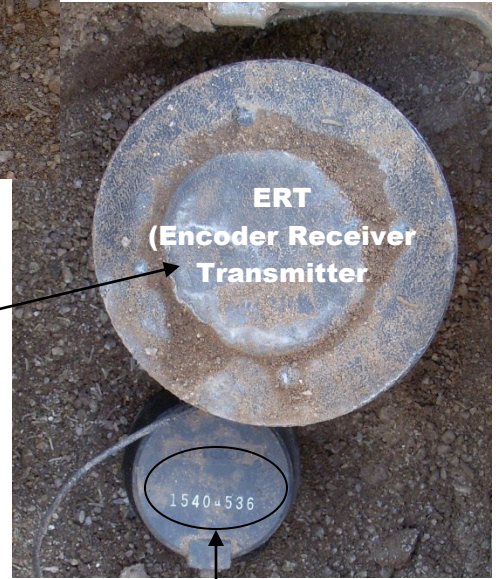
This is your Meter Number.

This unit transmits your water usage signal each month to our receivers. It is VERY important to keep it upright and clean of debris. This will ensure your meter will be read and transmitted correctly for billing. Report all loose and chewed wires!