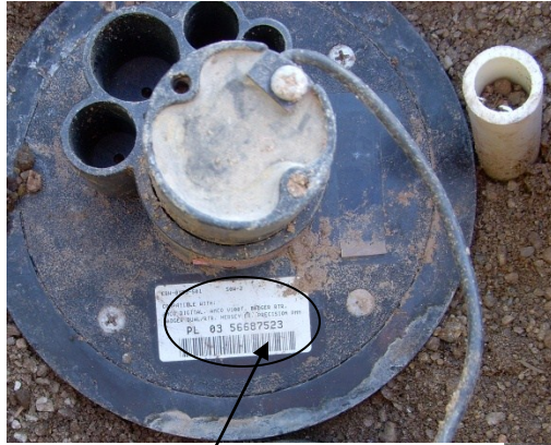
This is your ERT (Encoder Receiver Transmitter) Number.

This unit transmits your water usage signal each month to our receivers. It is VERY important to keep it upright and clean of debris. This will ensure your meter will be read and transmitted correctly for billing. Report all loose and chewed wires!