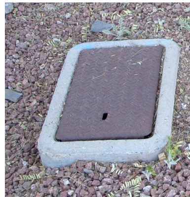
Does your Meter Box look like this? Meter boxes should be kept free of dirt and rocks.