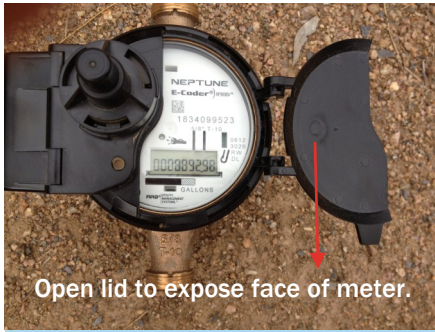
Open lid to expose face of meter.